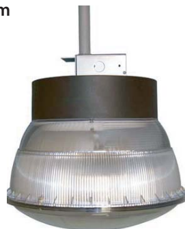
Pendant Mount to Junction Box