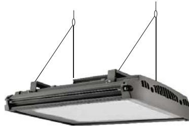
Supplied with Gripple Hangers (GPPL)