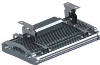
Adjustable Mounting Brackets (Standard)