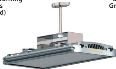
Pendant Mount 3/4" K.O. (PDM) Pendant Not Included