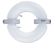
Circular Induction Lamp Inside