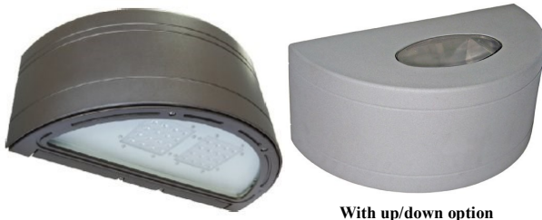
With up/down option