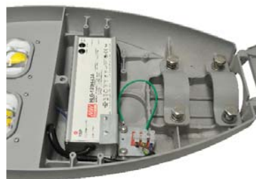
(2) Mounting Clamps (4) Stainless Steel Fastening Bolts