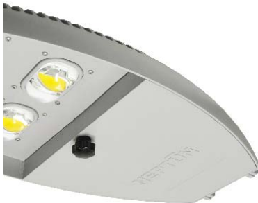
Accepts 1-1/4" - 2-3/4" O.D. Tenon or Pipe