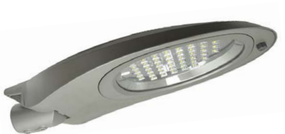
Accepts 1-1/4" - 2-3/4" O.D. Tenon or Pipe